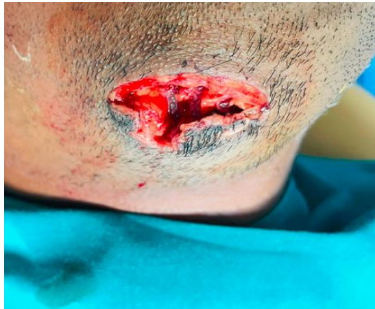
Fig. 2. Upon dissection along the injured tissue, injury to the submandibular gland was noted with constant dripping throughout the procedure