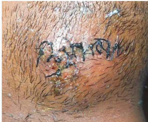
Fig. 3. The extraoral wound was closed in layers with an absorbable Vicryl suture and a Non-resorbable Mersilk suture