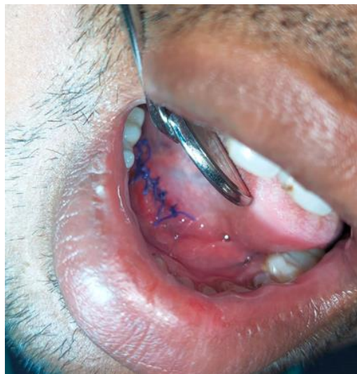
Fig. 4. The intra-oral wound was closed using an absorbable Vicryl suture