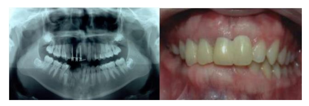
Fig. 3. Panoramic radiograph and frontal view after the installation of temporary implants and prosthesis at the age of 13