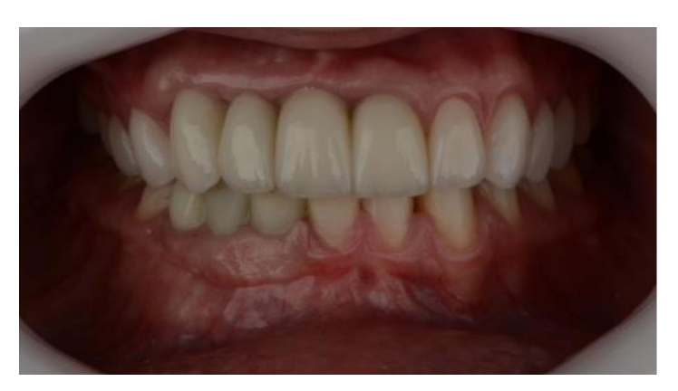
Fig. 5. Intraoral result after cementation of the ceramic veneers and installation of the crowns on implants