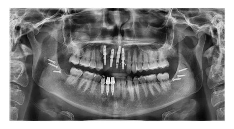
Fig. 4. Panoramic radiograph after the installation of the upper and lower implants, third molar extraction and orthognathic surgery