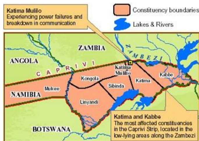
Map 1. Map of the Zambezi region with surrounding rivers

It is against this backdrop that [6] believe that reliable rainfall prediction is essential to rural communities. There is no theory of livelihood and coping strategies, As demonstrated by [7], the Ricardian model can be used to capture the effects of climate change and farm net revenue. In the context of this model, farm revenues could be treated as a proxy for income [8].